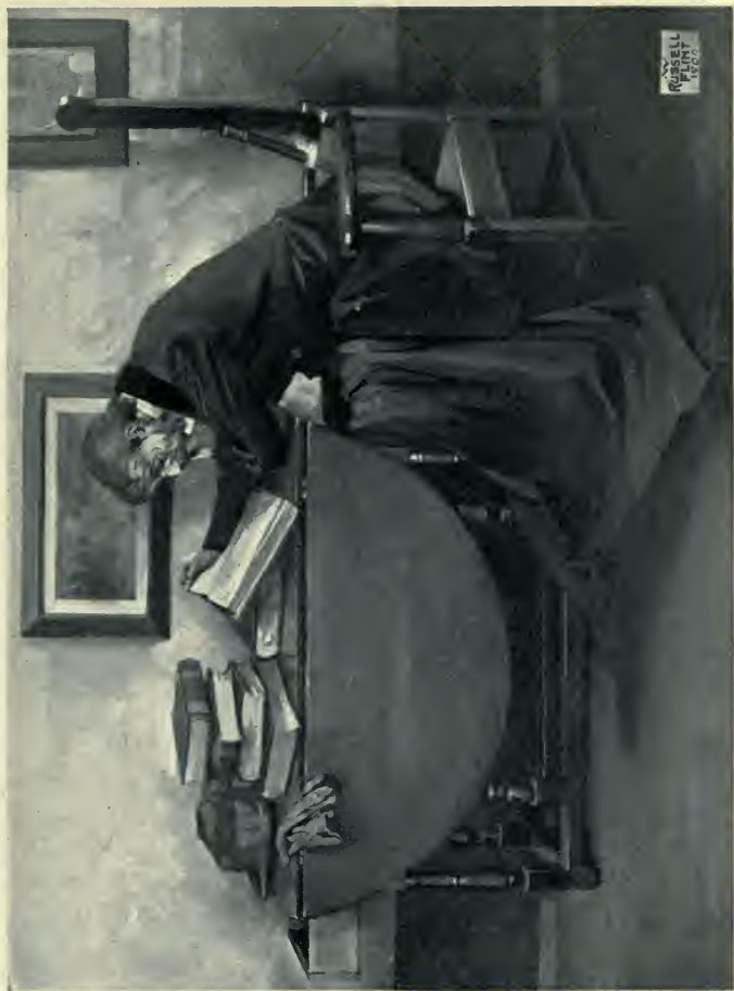
“CARLYLE, HIS MIND STARVING FOR WANT OF FOOD, DEVOURED THEM AT THE RATE OF ONE A DAY.”